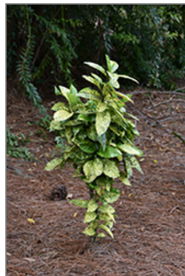
Marmorata Aucuba