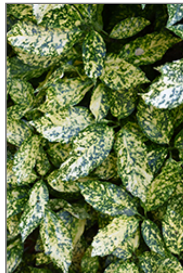
Crotonifolia Aucuba foliage

Crotonifolia Aucuba is recommended for the following landscape applications;