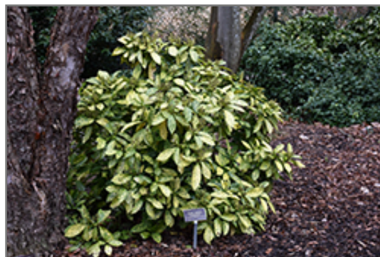
Crotonifolia Aucuba