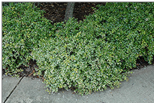
Hopley's Abelia

Hopley's Abelia is recommended for the following landscape applications;