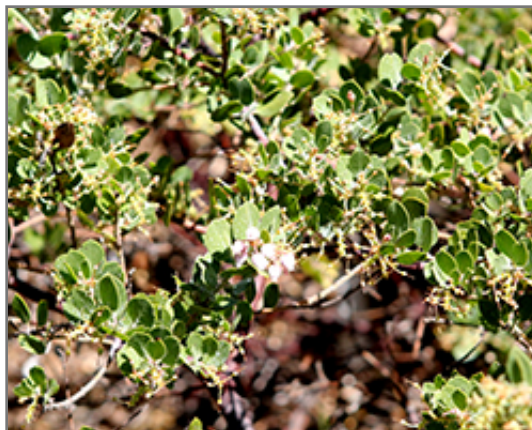
Big Sur Manzanita foliage

Big Sur Manzanita is recommended for the following landscape applications;