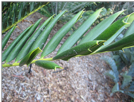
Mombasa Cycad foliage

Mombasa Cycad makes a fine choice for the outdoor landscape, but it is also well-suited for use in outdoor pots and containers. Because of its height, it is often used as a 'thriller' in the 'spiller-thriller-filler' container combination; plant it near the center of the pot, surrounded by smaller plants and those that spill over the edges. It is even sizeable enough that it can be grown alone in a suitable container. Note that when grown in a container, it may not perform exactly as indicated on the tag - this is to be expected. Also note that when growing plants in outdoor containers and baskets, they may require more frequent waterings than they would in the yard or garden.