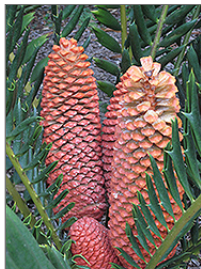
Mombasa Cycad fruit