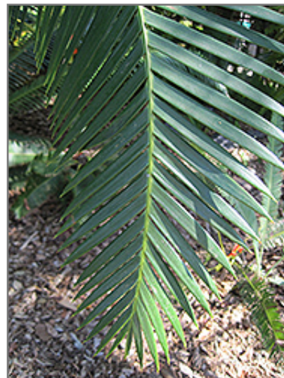
Mejia's Dioon foliage

Mejia's Dioon is a fine choice for the garden, but it is also a good selection for planting in outdoor pots and containers. Because of its height, it is often used as a 'thriller' in the 'spiller-thriller-filler' container combination; plant it near the center of the pot, surrounded by smaller plants and those that spill over the edges. It is even sizeable enough that it can be grown alone in a suitable container. Note that when growing plants in outdoor containers and baskets, they may require more frequent waterings than they would in the yard or garden.