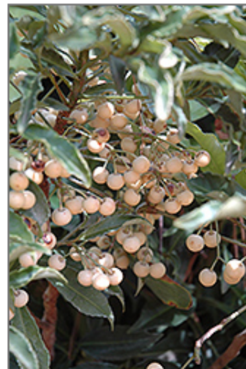
White Coral Berry fruit