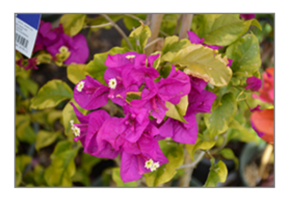
Golden Jackpot Bougainvillea flowers

Golden Jackpot Bougainvillea is recommended for the following landscape applications;