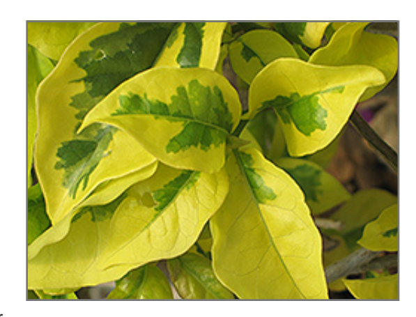
Golden Jackpot Bougainvillea foliage

Golden Jackpot Bougainvillea will grow to be about 20 feet tall at maturity, with a spread of 24 inches. As a climbing vine, it tends to be leggy near the base and should be underplanted with low-growing facer plants. It should be planted near a fence, trellis or other landscape structure where it can be trained to grow upwards on it, or allowed to trail off a retaining wall or slope. It grows at a fast rate, and under ideal conditions can be expected to live for approximately 20 years.