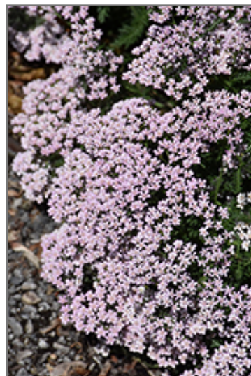
Lavender Deb Yarrow flowers