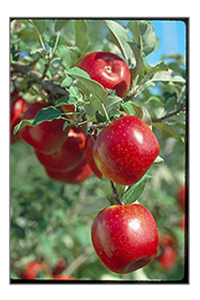
Prairie Spy Apple fruit

This is a deciduous tree with a more or less rounded form. Its average texture blends into the landscape, but can be balanced by one or two finer or coarser trees or shrubs for an effective composition. This is a high maintenance plant that will require regular care and upkeep, and is best pruned in late winter once the threat of extreme cold has passed. Gardeners should be aware of the following characteristic(s) that may warrant special consideration;