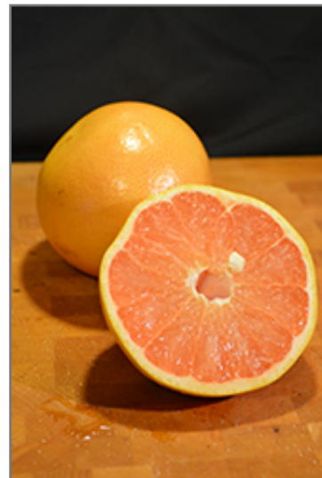
Ruby Red Grapefruit fruit and flesh

Aside from its primary use as an edible, Ruby Red Grapefruit is suitable for the following landscape applications;