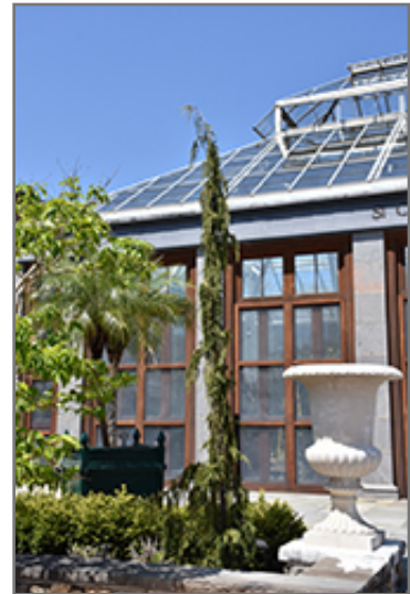
Stricta Weeping Nootka Cypress