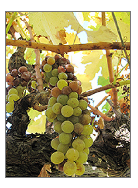
Sauvignon Blanc Grape fruit