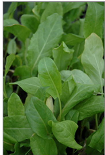
Sorrel foliage

Sorrel's attractive crinkled narrow leaves remain dark green in color with showy red variegation throughout the season on a plant with a mounded habit of growth. It features subtle spikes of green star-shaped flowers rising above the foliage in early summer.