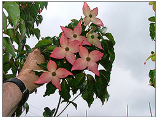
Scarlet Rose Chinese Dogwood flowers