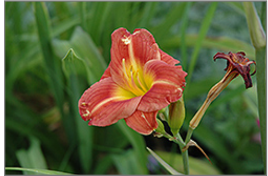
Wild Enchantress Daylily flowers

Reblooming, miniature, bicolor trumpets in red-orange with gold midribs and center; sturdy, strong, easy to care for, great grassy texture and form; good for the beginner gardener and the pro