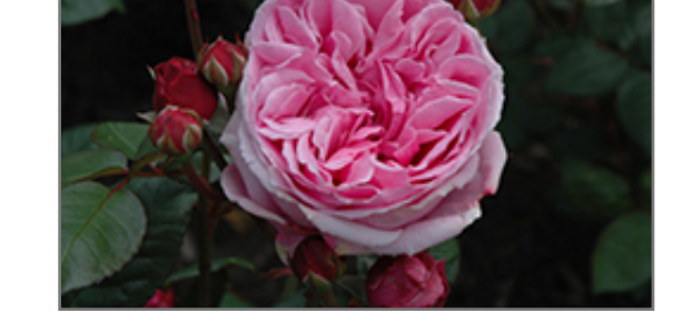
Bishop's Castle Rose flowers

Bishop's Castle Rose features showy fragrant rose cup-shaped flowers at the ends of the branches from late spring to early fall, which emerge from distinctive red flower buds. The flowers are excellent for cutting. It has dark green deciduous foliage. The glossy oval compound leaves do not develop any appreciable fall color.