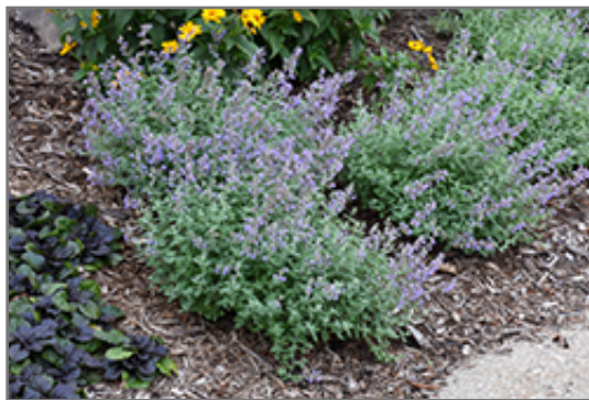
Purrsian Blue Catmint in bloom