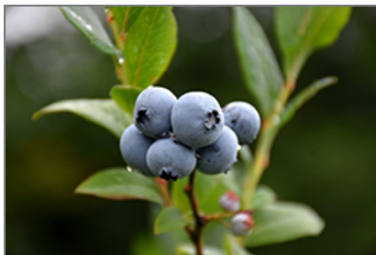
Northsky Blueberry fruit

Northsky Blueberry features dainty clusters of white bell-shaped flowers with shell pink overtones hanging below the branches in mid spring. It has green deciduous foliage. The glossy oval leaves turn an outstanding scarlet in the fall. It features an abundance of magnificent blue berries in mid summer.