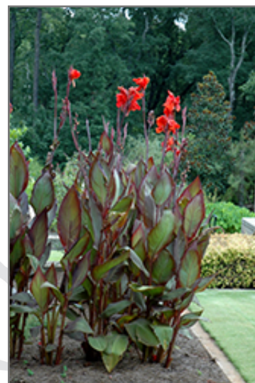
Australia Canna in bloom