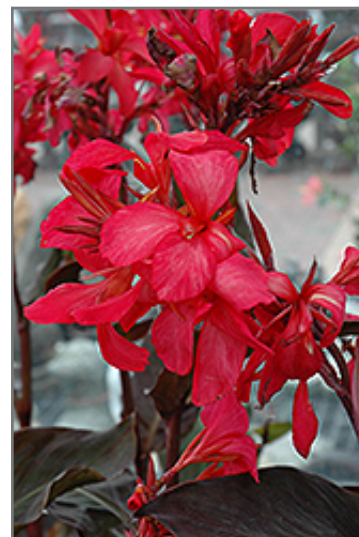
Australia Canna flowers

This plant should only be grown in full sunlight. It requires an evenly moist well-drained soil for optimal growth, but will die in standing water. It is not particular as to soil pH, but grows best in rich soils. It is highly tolerant of urban pollution and will even thrive in inner city environments, and will benefit from being planted in a relatively sheltered location. Consider applying a thick mulch around the root zone in winter to protect it in exposed locations or colder microclimates. This particular variety is an interspecific hybrid. It can be propagated by division; however, as a cultivated variety, be aware that it may be subject to certain restrictions or prohibitions on propagation.