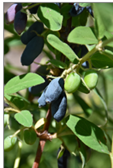
Cinderella Honeyberry fruit

Cinderella Honeyberry features subtle creamy white flowers along the branches in early spring. It has green deciduous foliage. The narrow leaves do not develop any appreciable fall color. It features an abundance of magnificent blue berries in late spring.