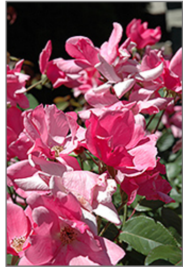
First Light Rose flowers

This plant is not reliably hardy in our region, and certain restrictions may apply; contact the store for more information.