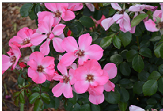
First Light Rose flowers

First Light Rose is recommended for the following landscape applications;