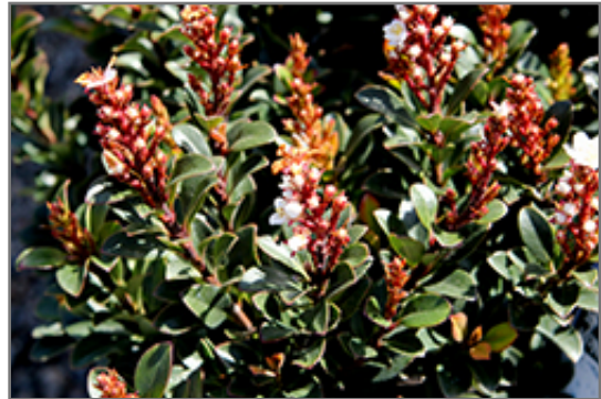
Dwarf Yeddo Hawthorn flowers

This plant is not reliably hardy in our region, and certain restrictions may apply; contact the store for more information.