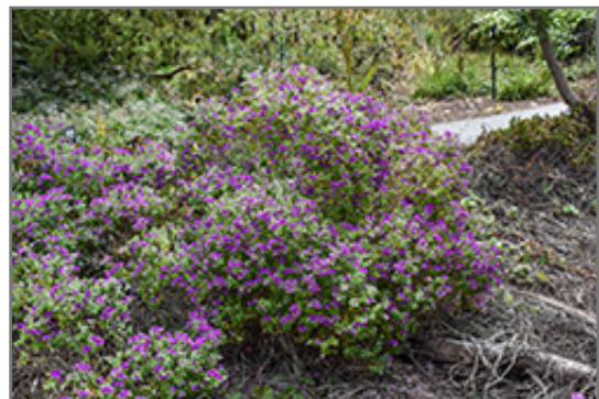
Petite Butterfly Sweet Pea Shrub flowers