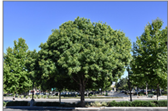
Chinese Pistache