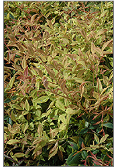
Gulf Stream Dwarf Nandina foliage

This plant is not reliably hardy in our region, and certain restrictions may apply; contact the store for more information.