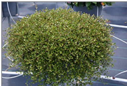
Wire Vine