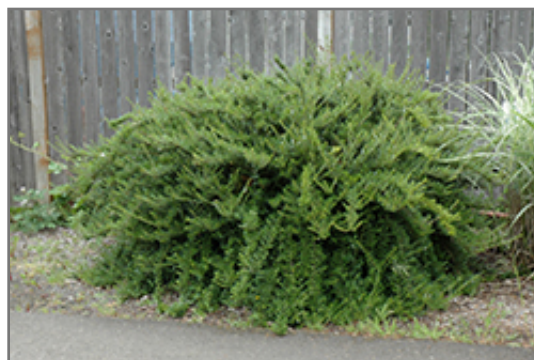
Box Honeysuckle