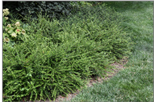
Box Honeysuckle

This plant is not reliably hardy in our region, and certain restrictions may apply; contact the store for more information.