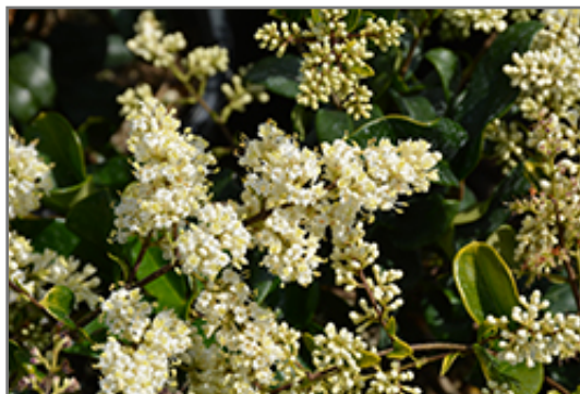
Texanum Japanese Privet flowers

Texanum Japanese Privet is recommended for the following landscape applications;