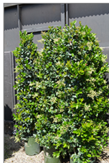
Texanum Japanese Privet (topiary form)