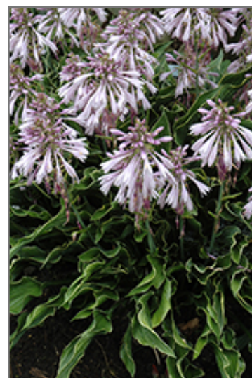
Praying Hands Hosta flowers