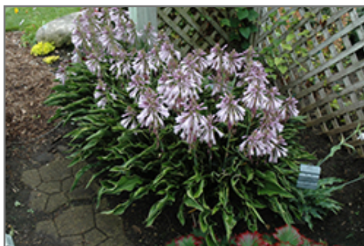
Praying Hands Hosta in bloom

Praying Hands Hosta is recommended for the following landscape applications;