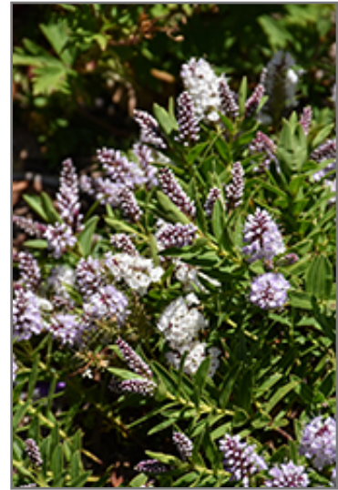
Menzies' Hebe flowers

This plant is not reliably hardy in our region, and certain restrictions may apply; contact the store for more information.