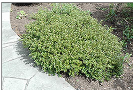
Menzies' Hebe