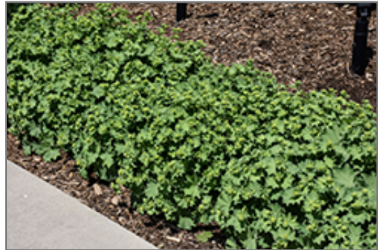
Gold Strike Lady's Mantle in bloom

Gold Strike Lady's Mantle will grow to be about 18 inches tall at maturity extending to 24 inches tall with the flowers, with a spread of 24 inches. Its foliage tends to remain dense right to the ground, not requiring facer plants in front. It grows at a medium rate, and under ideal conditions can be expected to live for approximately 10 years. As an herbaceous perennial, this plant will usually die back to the crown each winter, and will regrow from the base each spring. Be careful not to disturb the crown in late winter when it may not be readily seen!