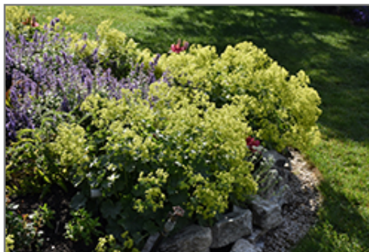
Gold Strike Lady's Mantle in bloom

Gold Strike Lady's Mantle is recommended for the following landscape applications;