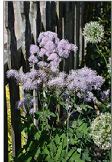
Meadow Rue flowers