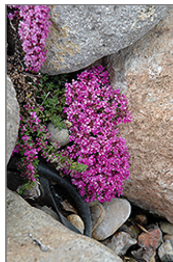
Pink Chintz Creeping Thyme in bloom