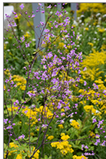
Splendide Meadow Rue flowers