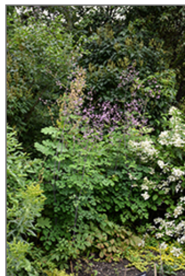
Splendide Meadow Rue in bloom