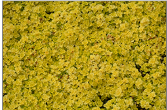
Golden Stonecrop foliage

Golden Stonecrop is recommended for the following landscape applications;