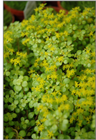
Golden Stonecrop flowers

This plant is not reliably hardy in our region, and certain restrictions may apply; contact the store for more information.