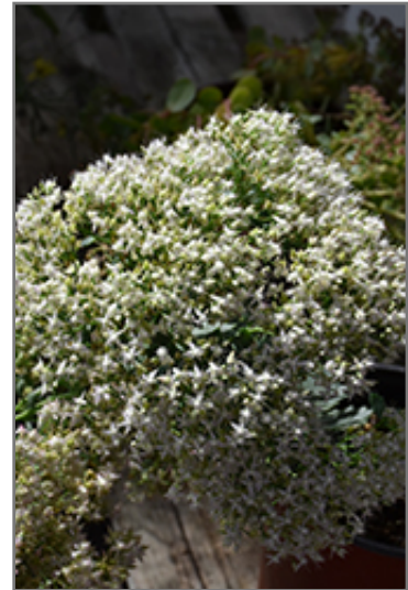
Thundercloud Stonecrop flowers

Thundercloud Stonecrop will grow to be about 8 inches tall at maturity, with a spread of 10 inches. When grown in masses or used as a bedding plant, individual plants should be spaced approximately 8 inches apart. It grows at a fast rate, and under ideal conditions can be expected to live for approximately 15 years. As an herbaceous perennial, this plant will usually die back to the crown each winter, and will regrow from the base each spring. Be careful not to disturb the crown in late winter when it may not be readily seen!