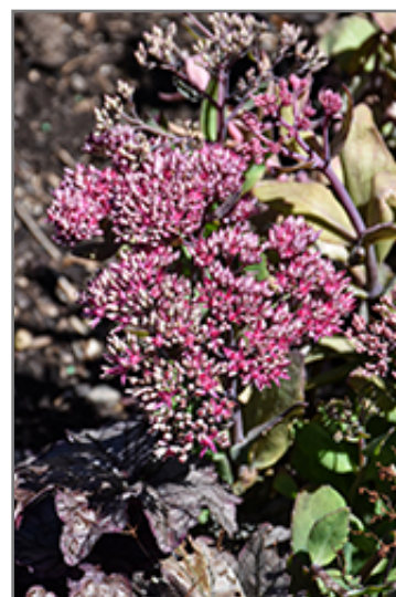
Cloud Walker Stonecrop flowers