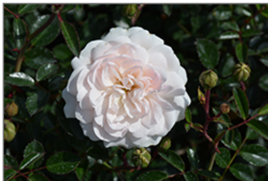
Sea Foam Rose flowers

Sea Foam Rose is recommended for the following landscape applications;