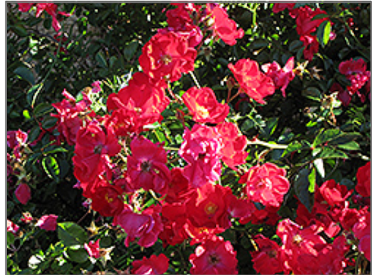
Flower Carpet Red Rose flowers

This plant is not reliably hardy in our region, and certain restrictions may apply; contact the store for more information.