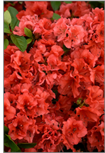
Girard's Hot Shot Azalea flowers