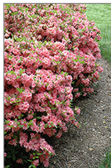
Blaauw's Pink Azalea in bloom