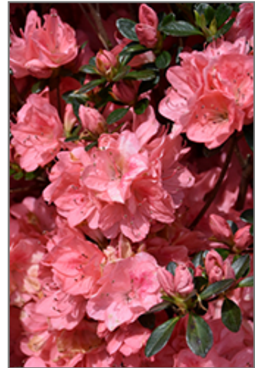
Blaauw's Pink Azalea flowers

This plant is not reliably hardy in our region, and certain restrictions may apply; contact the store for more information.