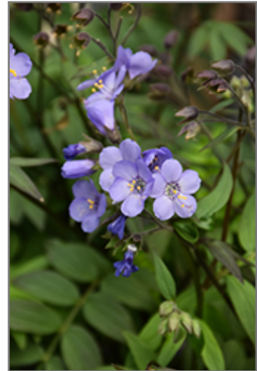
Heaven Scent Jacob's Ladder flowers

Heaven Scent Jacob's Ladder is a fine choice for the garden, but it is also a good selection for planting in outdoor pots and containers. With its upright habit of growth, it is best suited for use as a 'thriller' in the 'spiller-thriller-filler' container combination; plant it near the center of the pot, surrounded by smaller plants and those that spill over the edges. Note that when growing plants in outdoor containers and baskets, they may require more frequent waterings than they would in the yard or garden. Be aware that in our climate, most plants cannot be expected to survive the winter if left in containers outdoors, and this plant is no exception. Contact our experts for more information on how to protect it over the winter months.