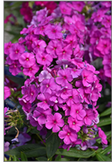
Flame Purple Garden Phlox flowers

Flame Purple Garden Phlox will grow to be about 10 inches tall at maturity, with a spread of 10 inches. When grown in masses or used as a bedding plant, individual plants should be spaced approximately 8 inches apart. It grows at a medium rate, and under ideal conditions can be expected to live for approximately 10 years. As an herbaceous perennial, this plant will usually die back to the crown each winter, and will regrow from the base each spring. Be careful not to disturb the crown in late winter when it may not be readily seen!