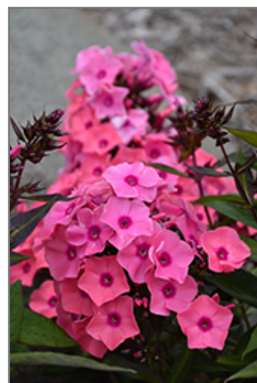
Coral Creme Drop Garden Phlox flowers