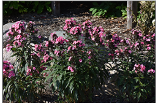
Coral Creme Drop Garden Phlox in bloom

Coral Creme Drop Garden Phlox will grow to be about 18 inches tall at maturity extending to 24 inches tall with the flowers, with a spread of 18 inches. When grown in masses or used as a bedding plant, individual plants should be spaced approximately 15 inches apart. It grows at a medium rate, and under ideal conditions can be expected to live for approximately 10 years. As an herbaceous perennial, this plant will usually die back to the crown each winter, and will regrow from the base each spring. Be careful not to disturb the crown in late winter when it may not be readily seen!