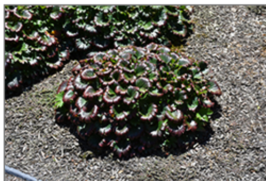
Crimson Fans Mukdenia