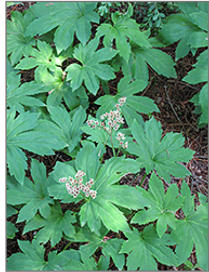
Crimson Fans Mukdenia flowers

This plant is not reliably hardy in our region, and certain restrictions may apply; contact the store for more information.