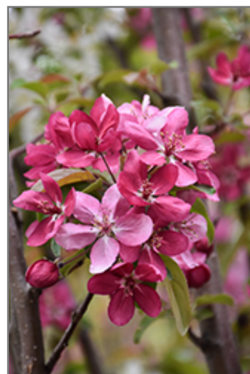
Velvet Pillar Flowering Crab flowers