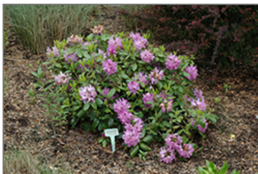
Minnetonka Rhododendron in bloom