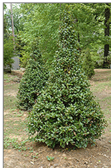
Castle Spire Meserve Holly