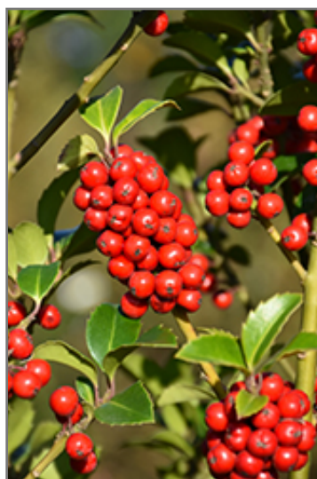
Castle Spire Meserve Holly fruit