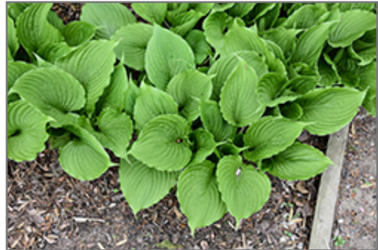
Blue Plantain Lily